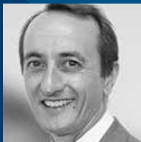
Dave Sharma FORMER MEMBER FOR WENTWORTH