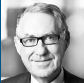
David Gonski AC

Kelly+Partners Scholars Foundation' Advisory Board will be comprise of leading Australian men and women distinguished in the fields of academia and business.